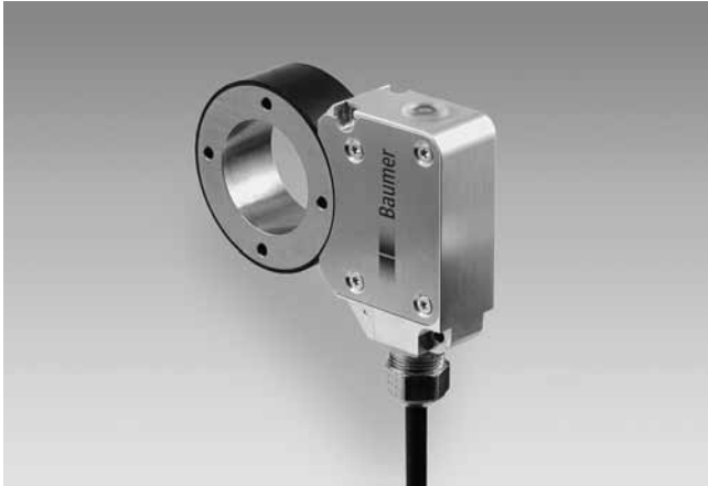
MHAD 50 with cable