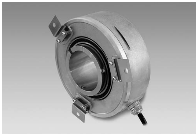
ITD 70 A 4 Y 2 with through hollow shaft